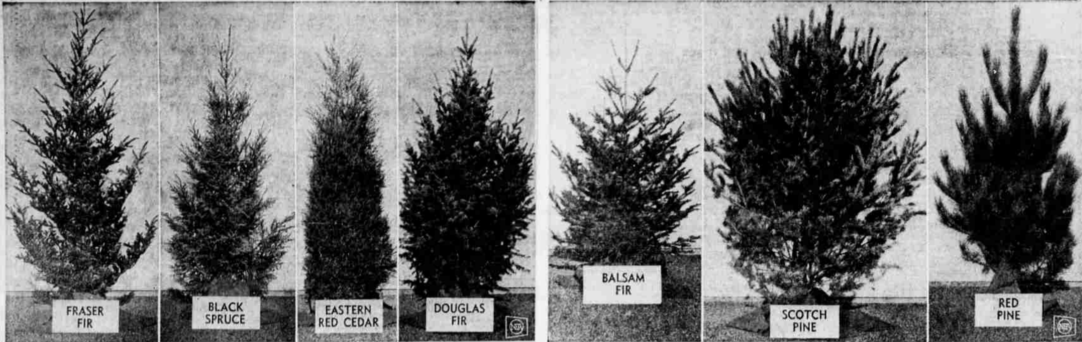
TREES OF CHRISTMAS — As is fitting at this time of year, the varieties of evergreen trees that adorn millions of homes across the nation are in the news. Seven of them are pictured below. Although all are beautiful

and have their adherents, some are preferred above others. Most popular of all is the shapely Douglas fir, grown in the Western half of the United States. Runner-up to it nationally and most popular in the East is the balsam fir. Closely related to the balsam is the Fraser fir. The Black spruce is most frequently seen in Great Lakes area and in the Northeast. Growing in popularity, however, are the fragrant Eastern red cedar and such long-needed trees as the Scotch pine, an immigrant to this country, and the red pine.