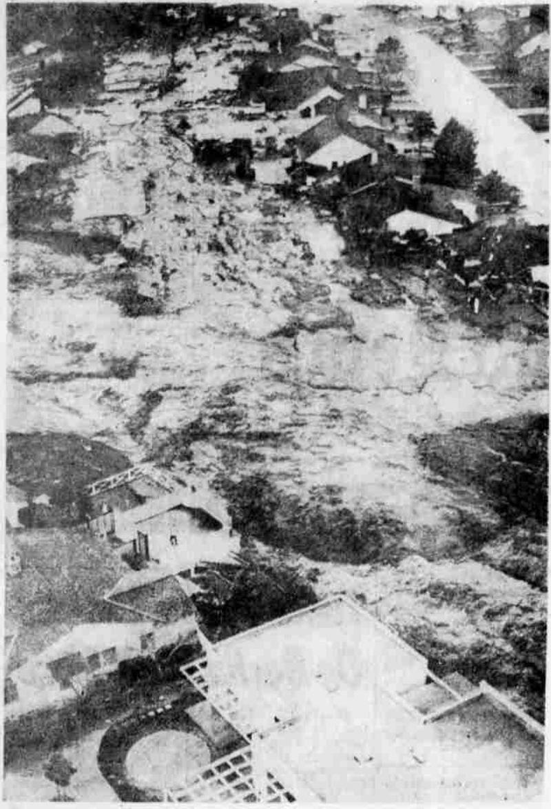
TOSSED LIKE TOYS — Water and mud cascade down street as millions of gallons of water roared into a heavily-populated suburb of Los Angeles Saturday when a reservoir dam burst tossing houses and auto like toys onto the crest of an unstoppable flood tide.