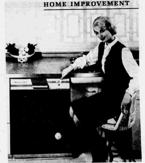
▶ Copper takes on a "wood" look in a KitchenAid dishwasher with variable-front styling which lets you change your dishwasher front at whim.