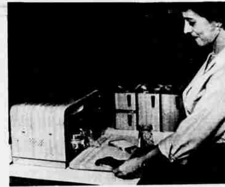
▲ Embossed in wood grain, and meant to feel like wood, are BeautyWare's frosted maple canisters and bread box, with a built-in slicing board.