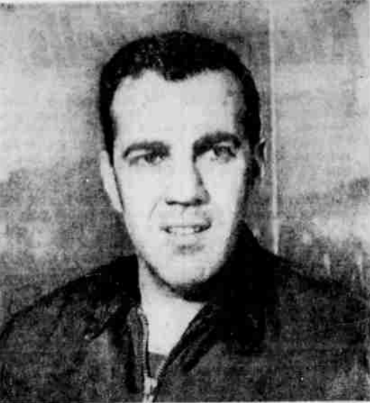
NEW COACH — Art Parseghian has been named new football coach at Notre Dame, succeeding interim coach Hugh Devore, who now becomes assistant athletic director.