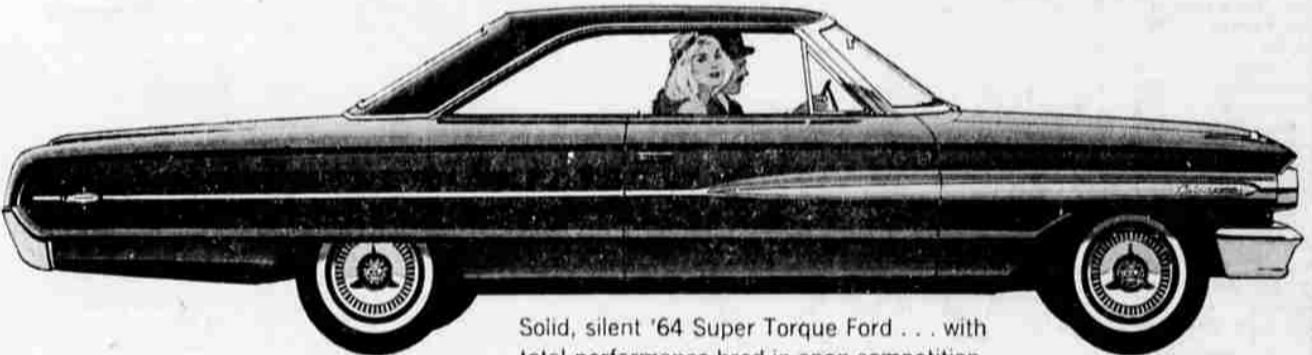
Solid, silent '64 Super Torque Ford... with total performance bred in open competition.

Ford made history at Riverside, Indianapolis, Atlanta, Monte Carlo. And now the '64 Fords are smashing sales records in Ford Dealer showrooms! Hot-selling Fords mean fast turnover, liberal trade-in allowance for your car.