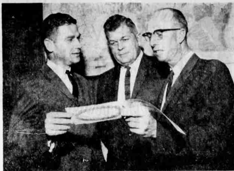
HERALD AND NEWS, Klamath Falls, Oregon Thursday, December 12, 1963 PAGE-30