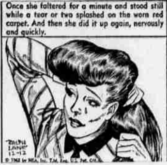
Once she faltered for a minute and stood still while a tear or two splashed on the worn red carpet. And then she did it up again, nervously and quickly.