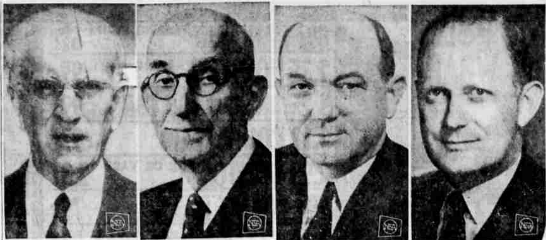
Rep. John W. McCormack Sen. Carl Hayden Dean Rusk C. Douglas Dillon