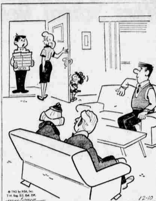
"Well, SOMEONE at this address ordered five Chinese dinners!"

The party central committee held its second plenary session in the Kremlin Hall of Congresses, with chemical experts, party and government planners, and industry officials speaking on Khrushchev's plan, which was virtually certain of approval. Khrushchev said the seven-year program, "unprecedented in world practice," would regenerate a failing agriculture with chemical fertilizers and also help satisfy demands for more consumer goods. He disclosed in his long speech to the opening of the party meeting Monday that Soviet collective and state farms delivered 21 per cent less grain to the state-controlled markets this year than last. He defended his decision to buy more than $700 million worth of wheat in the West and said Stalin let people starve during bad harvest years while continuing to export wheat. Then he outlined the seven-year program to increase farm yields and make such grain purchases unnecessary in the future. Khrushchev's plan for the chemical industry was double what had been expected. Its goals and details included: —Doubling the output of the chemical industry by 1970. —Investing $46 billion, including more than $25 billion for the plants themselves. —Producing 70 to 80 million tons of chemical fertilizer by the end of the plan, which would make it possible to double present grain and fodder production.