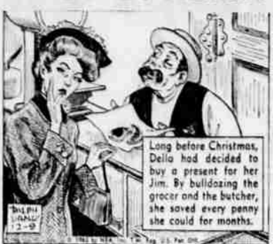
But whenever Mr. James Dillingham Young came home and reached his flat above, he was called "Jim"...