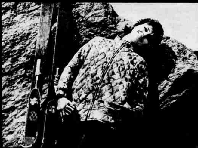
Sportcaster joins the trend to longer parkas with this yellow-green print of Antron nylon (below). Hood tucks under the Mandarin collar.