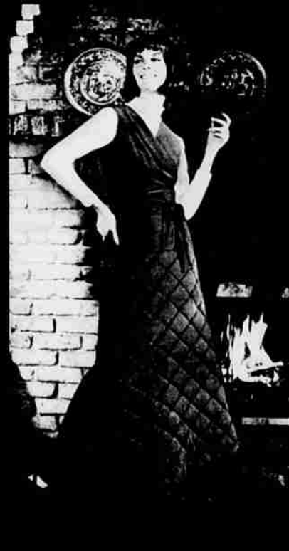
An ultra-feminine look invades the after-ski domain in a wine skirt of quilted nylon knit velvet, matching wraparound, and pink jersey. By Ulla.