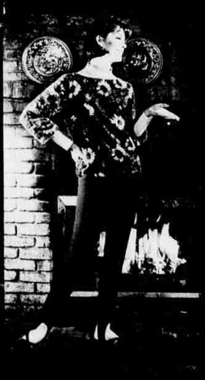
For after ski, wear this smart Orlon acrylic shaggy top with midnight-blue stretch pants by Pantino and a yellow nylon-silk turtleneck jersey by Ulla.