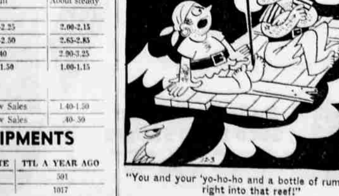
"You and your 'yo-ho-ho' and a bottle of rum' ran us right into that reef!"