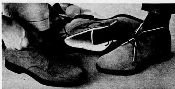
OR THEIR LIGHTWEIGHT COMFORT ...