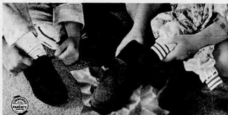
IS IT THEIR STEEL SHANK SUPPORT ...