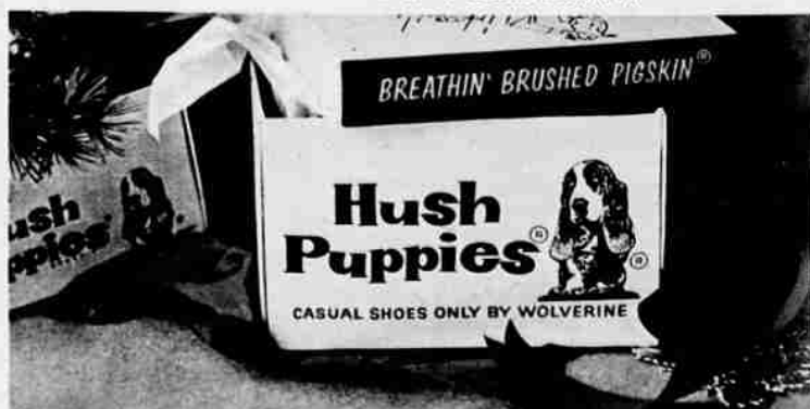
YES ... (AND A MERRY CHRISTMAS TO ALL).

Over 100 styles and colors available, from youngsters' size 10 (6.95 to 8.95) to women's size 11 and men's size 16 (8.95 to 10.95) / Golf and specialty shoes about 12.00 to 14.00 — at fine stores everywhere.