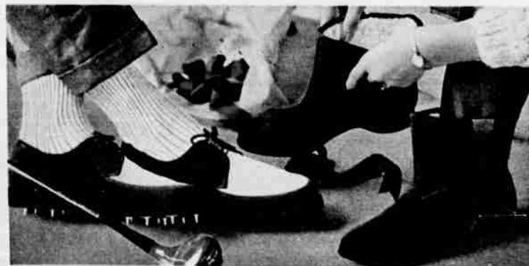
OR THEIR RESISTANCE TO SOILING AND STAINING?