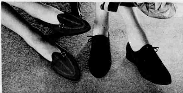
OR THEIR SOFT BRUSH-CLEAN PIGSKIN ...