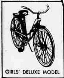
GIRLS' DELUXE MODEL

Safety coaster brake—leaves both hands free for steering.