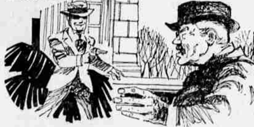
OCT. 14, 1912: Theodore Roosevelt, ex-president on his "Bull Moose" campaign, escaped assassination by a lunatic in Milwaukee when a manuscript deflected the bullet.