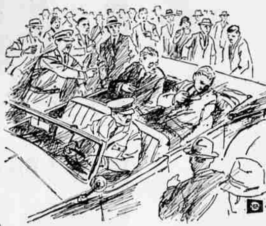
FEB. 15, 1933: Franklin D. Roosevelt was the target of anarchist Joseph Zangara at Miami, Fla. He missed but killed Chicago Mayor Anton Cermak in Roosevelt's car.