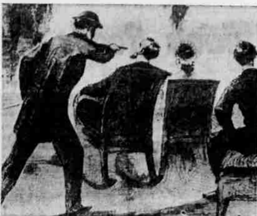
APRIL 14, 1865: Abraham Lincoln was the first president to be assassinated. Shot by John Wilkes Booth, actor, in Ford Theater, Washington, he died the next day.

—The Air Force in one year spent $5.5 to send material by commercial air freight when it could have gone on cheaper transportation for less than $1 million. One item was empty tool boxes worth $10 each which were flown to Korea at a charge