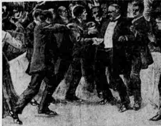
SEPT. 6, 1901: William McKinley, 25th president, was fatally wounded by Leon Czolgosz, anarchist, at the Buffalo Pan-American Exposition. He died on Sept. 14.