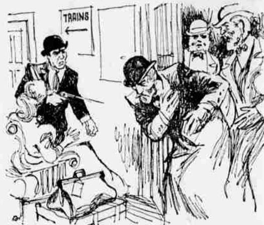
JULY 2, 1881: James A. Garfield was shot down by an unbalanced office-seeker, Charles J. Guiteau, in a Washington railway station. He died of his wounds Sept. 19.