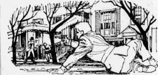
NOV. 1, 1950: Harry S. Truman was napping when two Puerto Rican radicals stormed Blair House in an assassination attempt. One was killed, the other wounded.