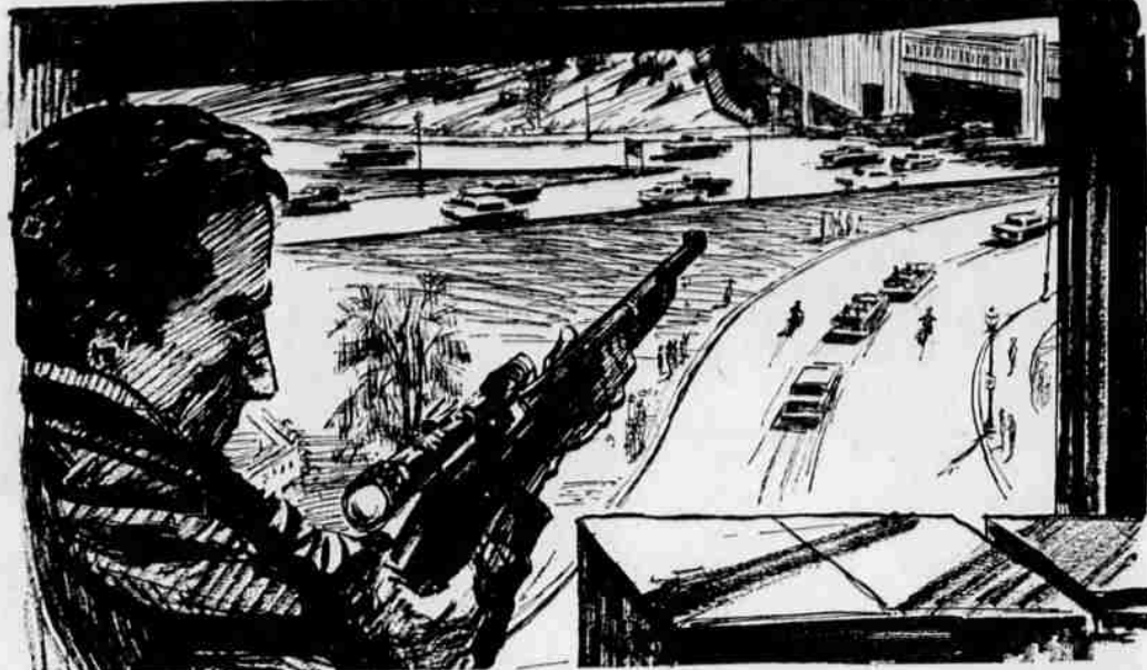
NOV. 22, 1963: Over the assassin's shoulder as he zeroes in on his target—President Kennedy.