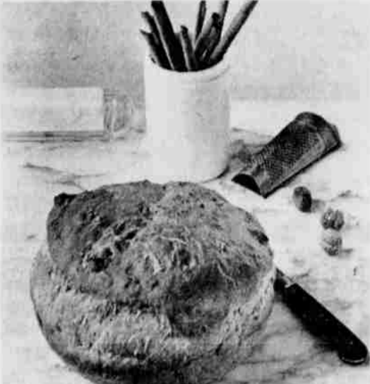
FOR HOLIDAY BRUNCH — Creole Casserole Bread is subtly spiced just right. For gourmet taste, grate nutmeg and cinnamon just before adding to the batter.

Scald milk; stir in sugar, salt, and margarine. Cool to lukewarm. Measure warm water into large warm bowl. Sprinkle or crumble in yeast; stir until dissolved. Add lukewarm milk mixture, cinnamon, nutmeg, and flour. Stir until well blended, about two minutes. Cover. Let rise in warm place, free from draft, until more than doubled in bulk, about one hour. Stir batter down. Beat vigorously, about 1/2 minute. Turn into greased 1 1/2 quart casserole. Bake immediately, uncovered, in a moderate oven (375 degrees F.) for about one hour, or until done.