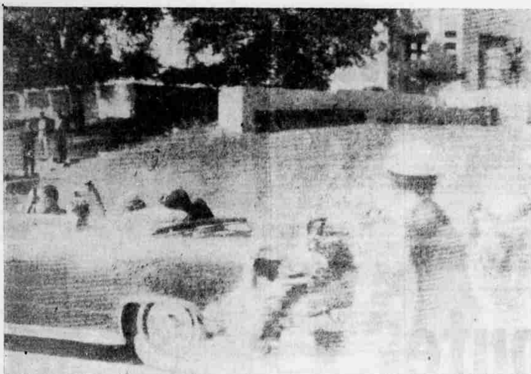
WHEN BULLET STRUCK — President Kennedy slumps into the arms of his wife immediately after the sniper's bullet struck in Dallas. Photo was made by a woman watching the motorcade.