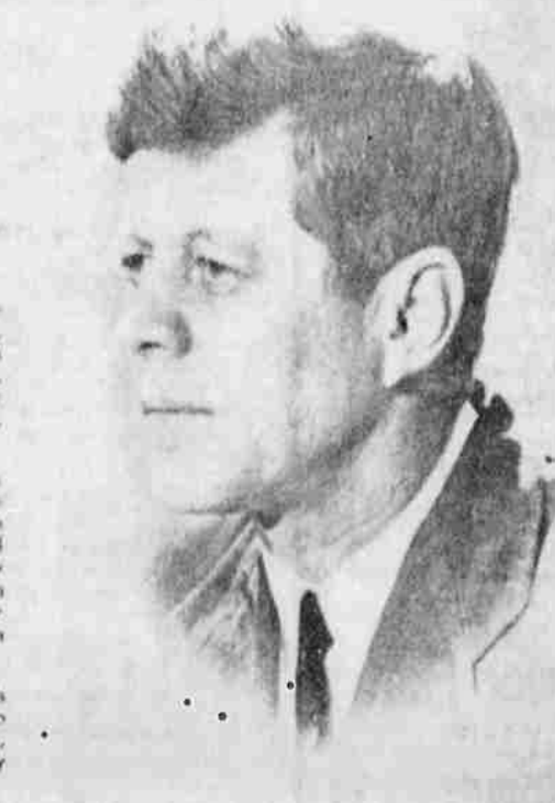
of the late President on one side and a prayer on the reverse side with his name and dates of his birth and death.