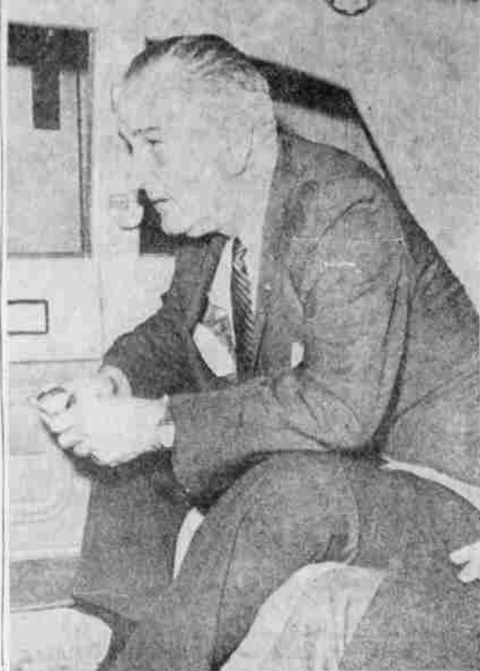
HEAVY BURDEN — After a long, weary day, President Lyndon Johnson leaves his office in the Executive Offices Building in Washington Monday night at 10:41 for his home. Note that the Chief Executive, seated in the back seat of his limousine, is wearing safety belt.

The Chief Executive was reported to have stressed his backing for federal programs to aid education in expressing general support for Kennedy's legislative goals.