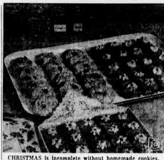
CHRISTMAS is incomplete without homemade cookies.

Bright new ideas for food that can be prepared weeks in advance are welcome to the busy cook who must prepare meals every day as well as be ready for that season in the year when friends drop in. LOAF FRUITCAKE (Makes 2 loaf cakes) 2½ cups sifted all-purpose flour 1 teaspoon baking soda 4 eggs, slightly beaten 2¼ cups (one 20-oz. jar) ready-to-use mince meat 1¼ cups (10-oz. can) sweetened condensed milk 1 (1½ lb. jar) chopped fruits and peels 1 cup coarsely sliced walnut meats