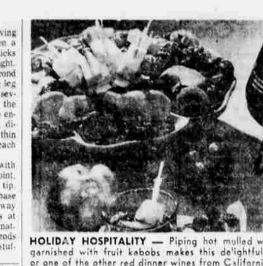
HOLIDAY HOSPITALITY — Piping hot mulled wine served in heat proof glasses and garnished with fruit kabobs makes this delightful wine-fruit cup. One to be enjoyed with the heart-warming companionship of friends.