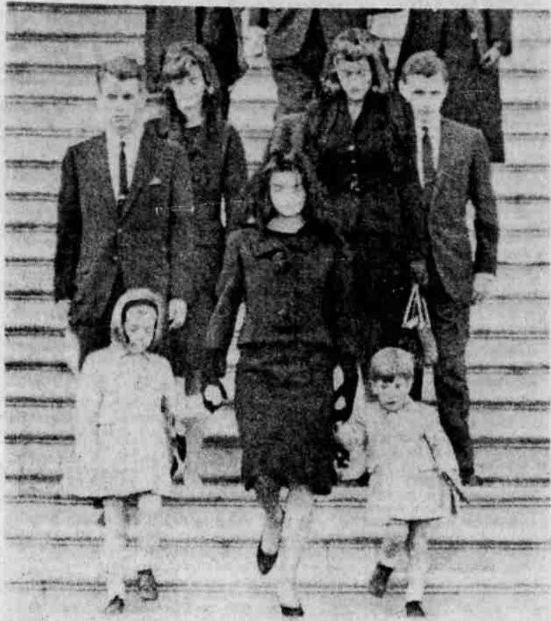
ATTEND CEREMONIES — Mrs. Jacqueline Kennedy, holding hands of her children, Caroline and John Jr., leads group from the Capitol after ceremonies honoring her late husband, President John Kennedy. Behind, left to right, are Attorney General Robert Kennedy, his sisters, Mrs. Stephen Smith, and Mrs. Pat Lawford, and brother-in-law Stephen Smith.

WASHINGTON (UPI)—By the tens of thousands, they came to look on the bier of their dead leader—many weeping openly, others seemingly bewildered.