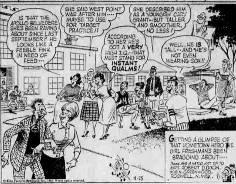
GETTING A GLIMPSE OF THAT HOMETOWN HERO THE GIRL FRESHMANS BEEN BRAGGING ABOUT...