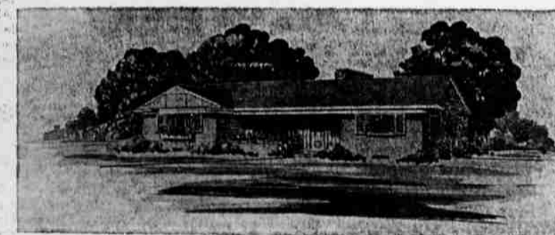
DESIGN 499 1,675 Sq. Ft. 32,067 Cu. Ft.