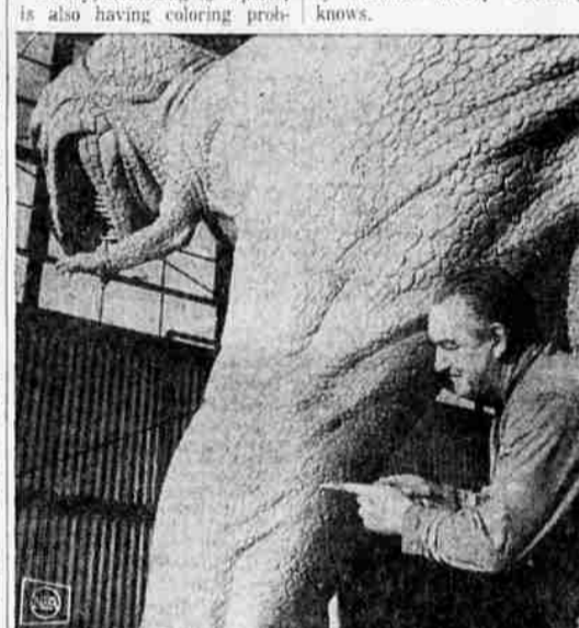
THE FINAL TOUCH — A sculptor fashions the hide of a beast in the making at Disney Studios, Calif.