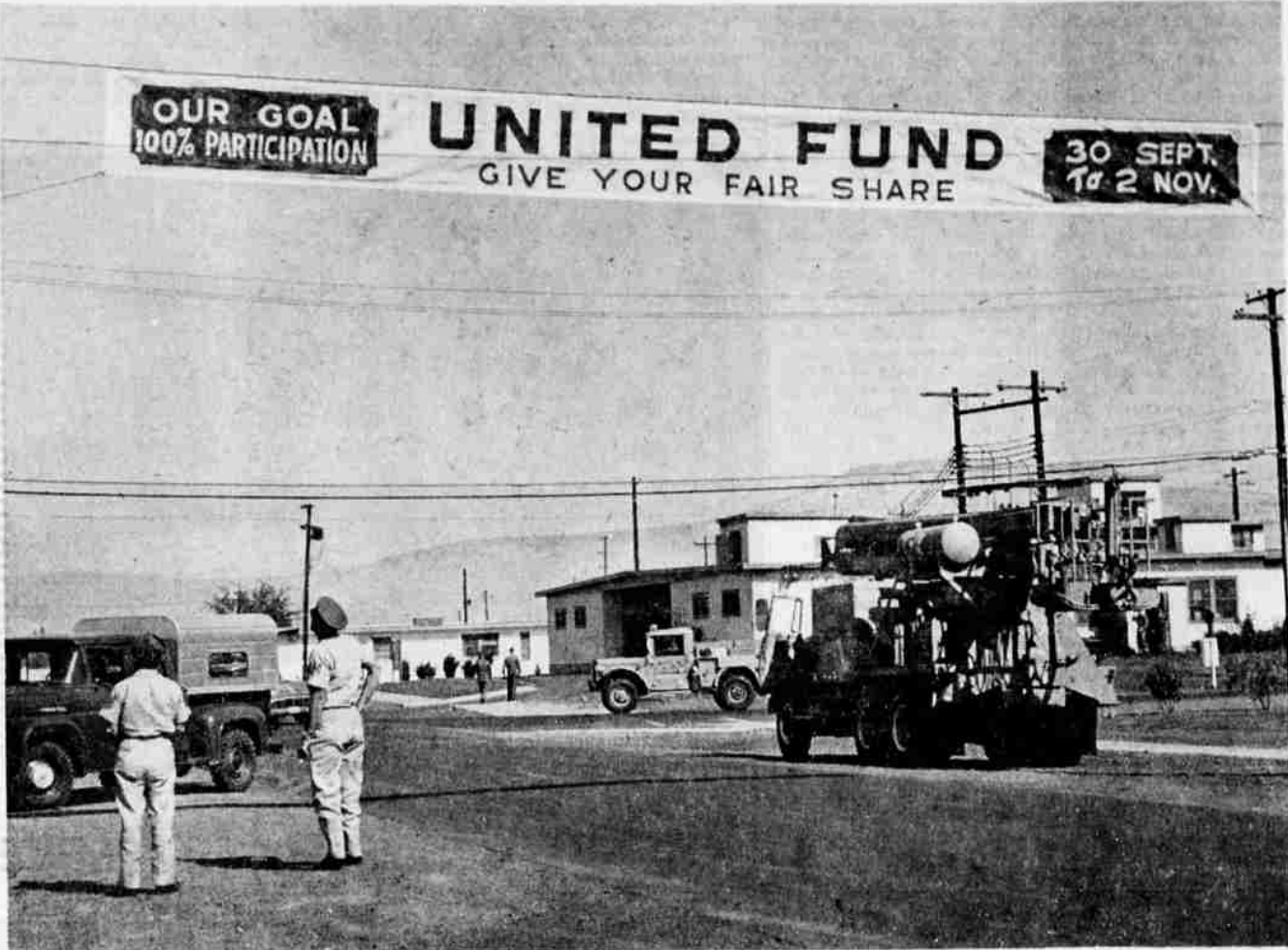
BANNER SCREAMS THE START OF FUND DRIVE — Two Kingsley Field airmen observe a banner that alerted base personnel to the beginning of the United Fund Drive, which ended successfully with the air field surpassing its goal by some 33 per cent. Kingsley Field was to have raised $7,000 during the month long drive, but through direct donations and the raising of revenues from special projects it collected at total of $9,298.84.

pushing the final total well above the $7,000 goal.