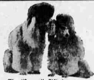
The "Secret", Fifi, is... My Mommy has me groomed Professionally