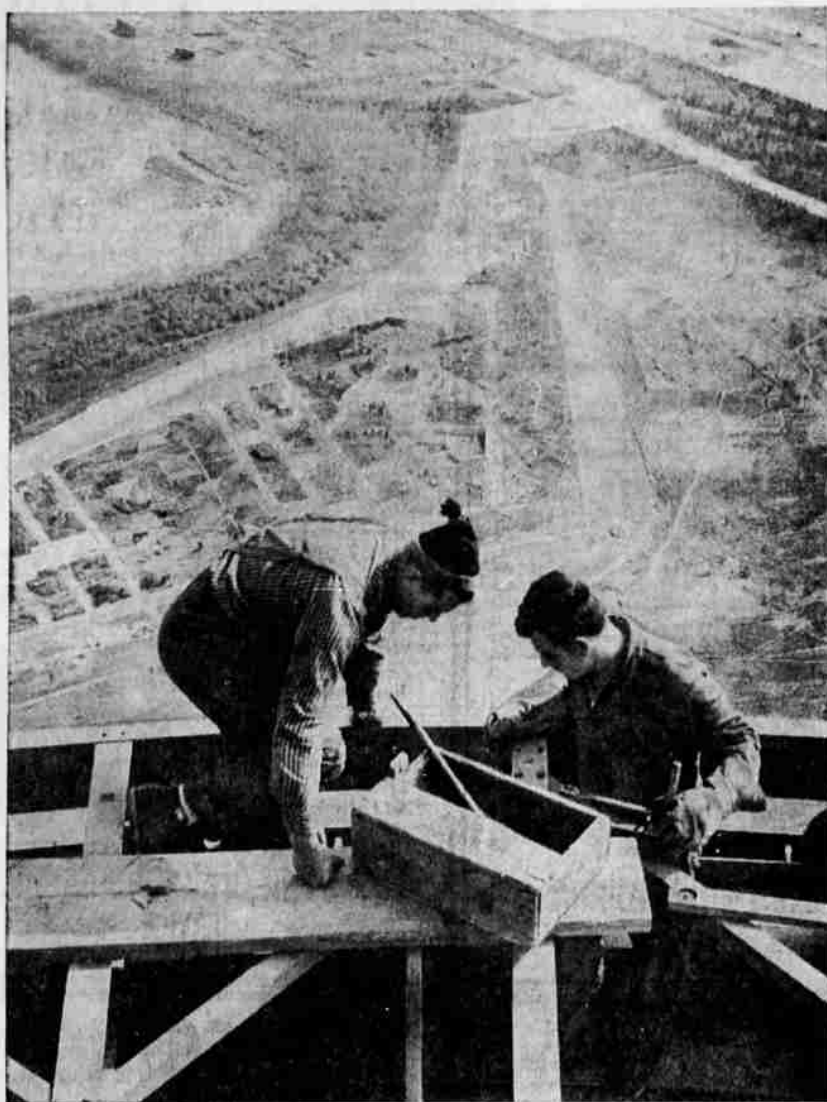
DIZZYING, ISN'T IT? —High-living construction men don't give the view a second thought (they'd better not) in Vienna, Austria, where the Danube Tower of Vienna's 1964 Garden Exhibition is under construction.