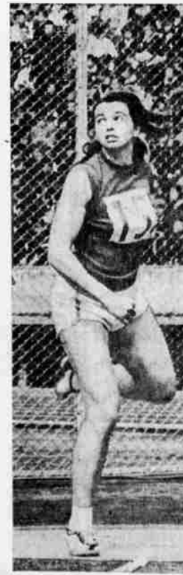
DISCUS DOLL —Uncle Sam's Olga Connolly took silver medal for second place in woman's discus, at Tokyo's pre-Olympic meet.