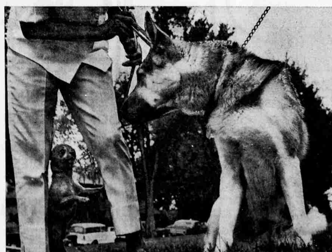
"WHAT IS IT?" —Mutual curiosity society holds a two-member meeting in Denver, Colo., during a dog show. Morsel of canine, left, considers all that dog not at all possible. Same thought, in reverse, occupies the big fellow.