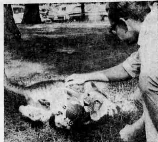
NICE KITTY—MAYBE —Delta Tau Delta fraternity at Emory University, Atlanta, Ga., won't go to the dogs while THIS lion mascot is on campus. But what happens when he's too big for his kitten britches . . . ?