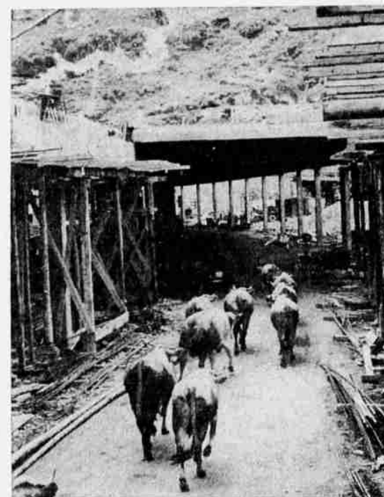
SUMMER'S BEHIND THEM —Returning from summer pasture, cows amble through a new toll station for the Grand St. Bernard tunnel, Switzerland.