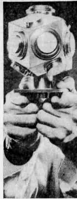
SUN-SEEKER —The many-eyed gadget, above, is designed to keep tab on the sun as a reference point for proper in-flight position of Agena satellites.