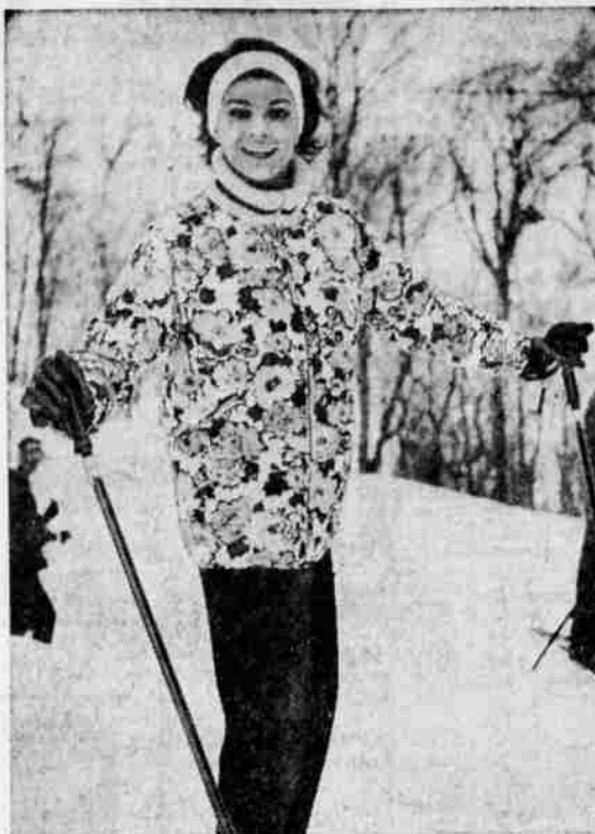
SKI SLOPE GARDEN —Mountain roses blossom on this reversible, synthetic fiber-lined jacket. The setting is a real cool Vermont ski slope.