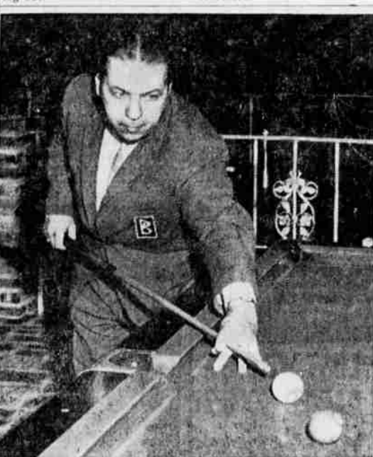
APPEARANCE SLATED — Jimmy Caras, four-time world billiard champion, will appear at the Cushion Corner in Klamath Falls Thursday, with exhibitions slated for 2 and 7 p.m. The billiard expert will hold demonstrations and meet local talent in matches.