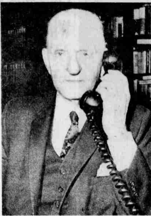
PLANS TO RETIRE — Rep. Carl Vinson (D-Ga.), one of the most powerful and colorful figures in Congress, announced that he would not run for re-election, but will retire at the end of 1964 after serving 50 years, an all-time House tenure record.