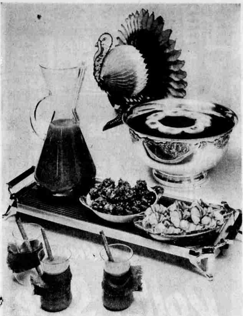
TOAST THANKSGIVING TURKEY — Ideal prelude to Thanksgiving dinner are these flavorful punches — chilly Cranberry Bowl with a colorful ice ring afloat, or a steaming carafe of Hot Spiced Mary Punch, served in mugs with cinnamon stick stirrers. Liver-stuffed mushrooms and Shrimp in Blankets make delicious appetizers.