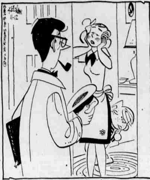
"HE'S BEEN SINGING 'POLLY WOLLY DOODLE' ALL THE DAY. AND I MEAN ALL THE DAY!"