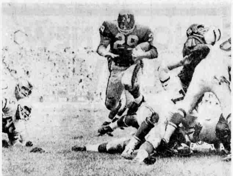
BIG SCORING HOLE — New York Giants' Alex Webster (29) finds a gaping hole in the Philadelphia Eagles' defense and leaps through to score in the second quarter of the game which the home-standing New Yorkers won 42-14. Y. A. Tittle fired three touchdown passes to aid the Giant effort.