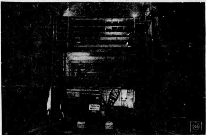
STEEL NETWORK — Network of steel plate buildings like this will eventually fill the NORAD tunnels, housing 350 permanent personnel and up to 700 in emergency.

With about two years to go to completion, this is how the great underground mountain home for North American Air Defense command post looks today. Human moles have burrowed into Cheyenne Mountain, near Colorado Springs, Colo., at the 7,000 foot level. First construction has started on a three-story, steel plate building which will house the nerve center of the free world aerial defense system. Overhead will be 800 to 2,500 feet of solid granite. Building will house millions of dollars worth of intricate machinery for detection, tracking and analysis, with a staff of 350 to 700 officers and men. It will sit on an insulating cushion of 931 giant coil springs. Building is designed to withstand all but a direct hit from an H-bomb in the event nuclear war should ever break out.