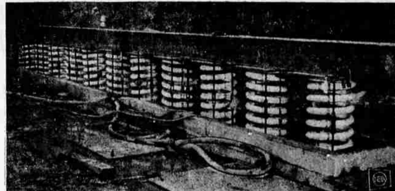
BOMB SHOCKS — These are some of the 931 coil springs on which the steel house of NORAD will sit to insulate it from bomb shock in case of attack.