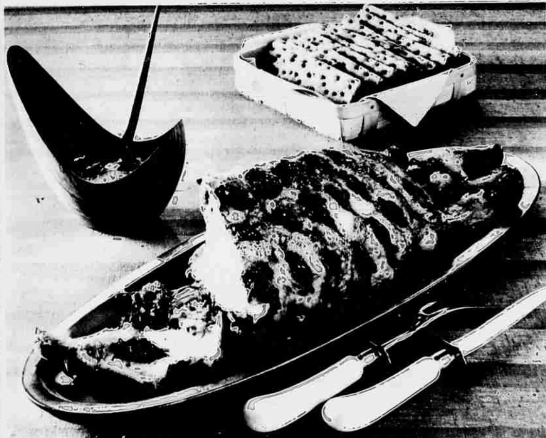
Prunes inserted into pork roast add succulence and fine flavor to please epicurean tastes.