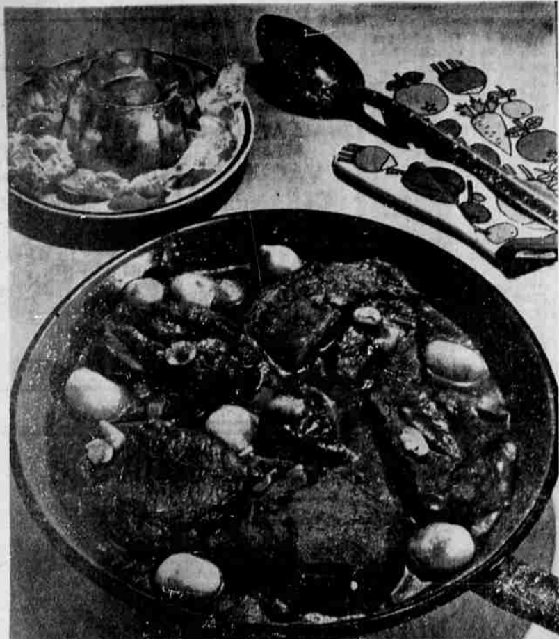
ECONOMICAL - DELICIOUS — This hearty Swiss Steak dinner features an economical cut of plentiful range-fed beef. Properly prepared Swiss Steak needs no apology.

Crescent Extracts give you a full measure of flavor