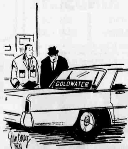
"Funny thing, ever since I put that sticker on, it's been pulling to the left."