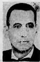
By COL. RAY CROMLEY Newspaper Enterprise Military Analyst

Surely by 1970 we shall have matured enough on both sides of the world to be able to do the same thing on the moon.