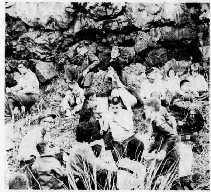
CUB SCOUT OUTING — All members of the family were invited to the recent outing planned by Siskiyou County Cub Scouts at the Pluto Lava Caves near Grenada. The sack supper at the mouth of the caves, pictured here, was well received after moms and dads joined the young scouts for a hike into the black caverns. An evening campfire and candlelight Bobcat ceremony concluded the activities for some 400 persons who participated in the fall outdoor and underground roundup.