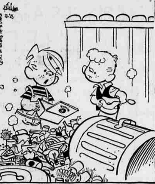
* WHY WOULD ANYBODY BE DUMB ENOUGH TO THROW AWAY A PERFECT GOOD CIGAR BOX? *