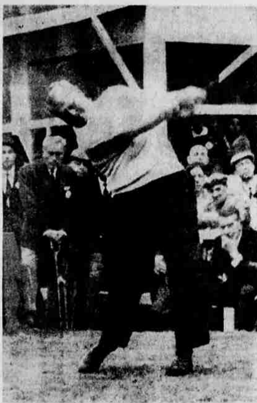
THE FIRST TEE — Burly Jack Nicklaus, of Columbus, Ohio, tees off on the St. Nom La Breche links near Paris Wednesday in the first round of the Canada Cup tournament. Nicklaus, with a 67, and Arnold Palmer, with a 69, gave the U.S. a tie for the team lead with Canada at the end of the round.