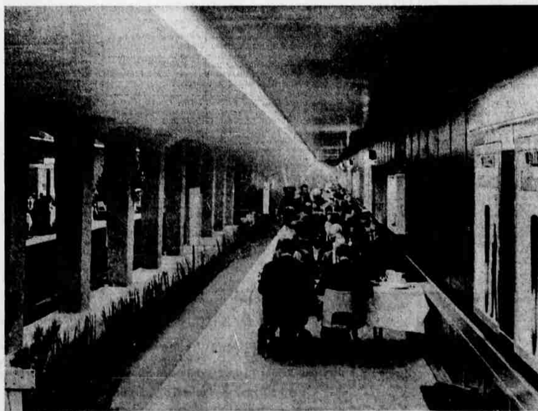
SUBWAY SUPPER —The still-unfinished Leuvehaven subway station in Rotterdam, Holland, offers a novel setting for a dinner for persons working on the tracks. As soon as the tracks are laid, the walls will reverberate with the sound of rushing trains, hardly the spot to sup. They'll have to enjoy the sweet repose as long as it lasts.