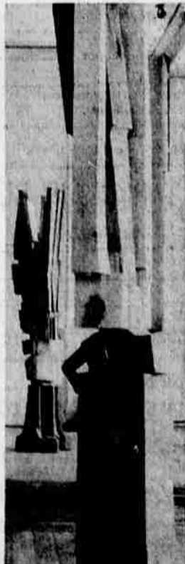
JUST SCRAP —Discarded furniture and wood remnants are used by Peter Startup for his creations. He makes 'em in England.