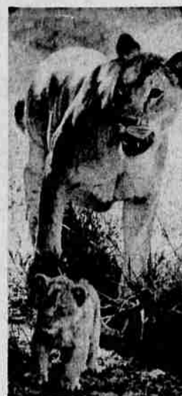
PROUD OF LION —Princess appears fiercely proud as she follows her male cub, Lee, on his first walk in the sun. In the shelter of his mom's well-muscled forelegs, Lee surveys the exciting world of the Bronx Zoo, in New York.