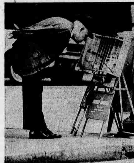
FREEDOM READER —This Houston, Tex., gentleman is doing a little visual free-loading. He's sneaking a glance at the day's newspaper through a transparent vending machine. If the news is enticing, he'll buy.