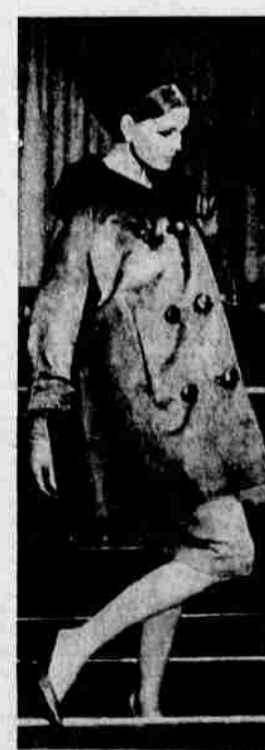
WHAT FUR —This three-quarter trotteur of sheared Alaskan seal, elegantly trimmed with a collar of dark ranch mink is for the cooler climes. It's shown in New York City.