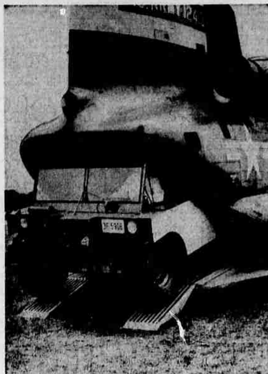
METAL MONSTER'S MEAL —A military vehicle is quite a diet for anything, but the Chinook Helicopter, known to the layman as a flying garage, eats it up easily.