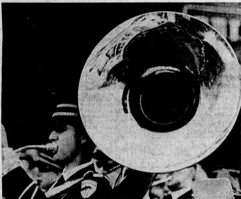
AIR FORCE —U.S. Army musician forces air through a Sousaphone to help make martial music during a parade in West Berlin. It takes good lungs to do it.