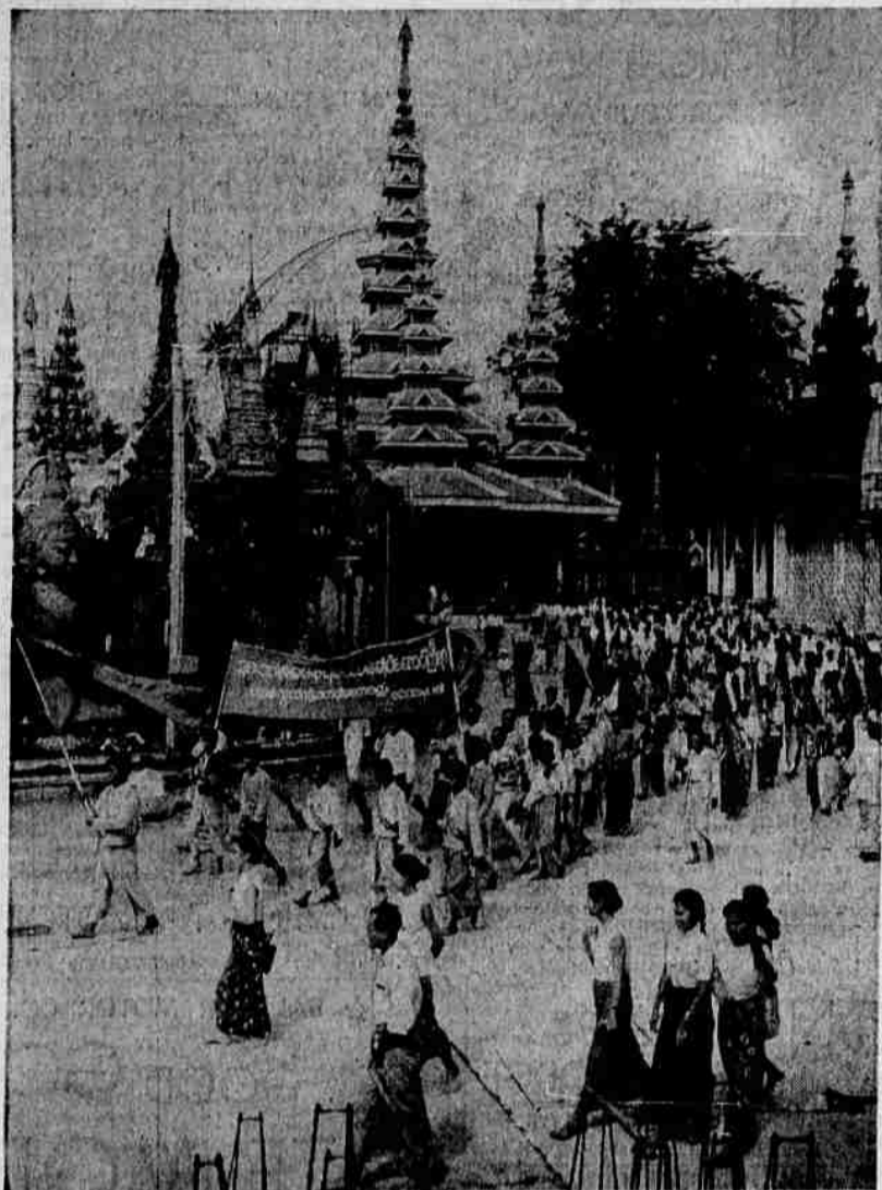
BANNERS OF PROTEST —With ornate pagodas in the background, members of a Burmese political party march in protest against the government. The demonstrators prayed at the nearby pagoda for the release of party leaders who were arrested.