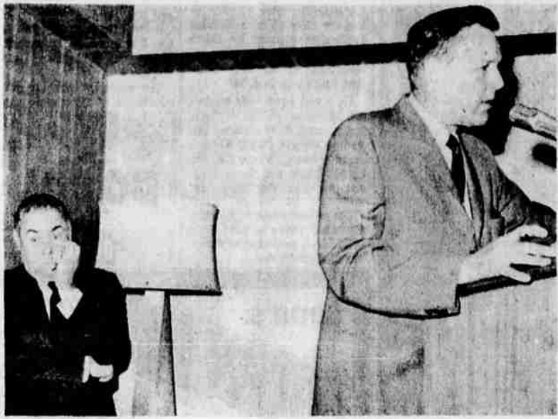
MOVES UP — New York manager Ralph Houk talks to reporters after the change in command was announced by the Yankees as retiring general manager Roy Haney (left) takes a back seat. Houk, who succeeded Casey Stengel as Yankee manager three years ago, won three pennants, and two World Series. Yogi Berra has been named as possible Houk successor.