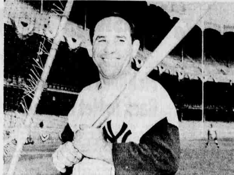
SET FOR ADVANCEMENT —Yogi Berra, long-time New York Yankee catcher and coach during the past season, will be signed Thursday as successor to manager Ralph Houk who has been named general manager of the Yankees, succeeding Roy Haney. Berra is reported to have turned down the managerial post at Baltimore and Boston.

Thus far this year, although winning only one of five outings, the Owls have doubled the attendance figure through their wide-open style of play over last year.