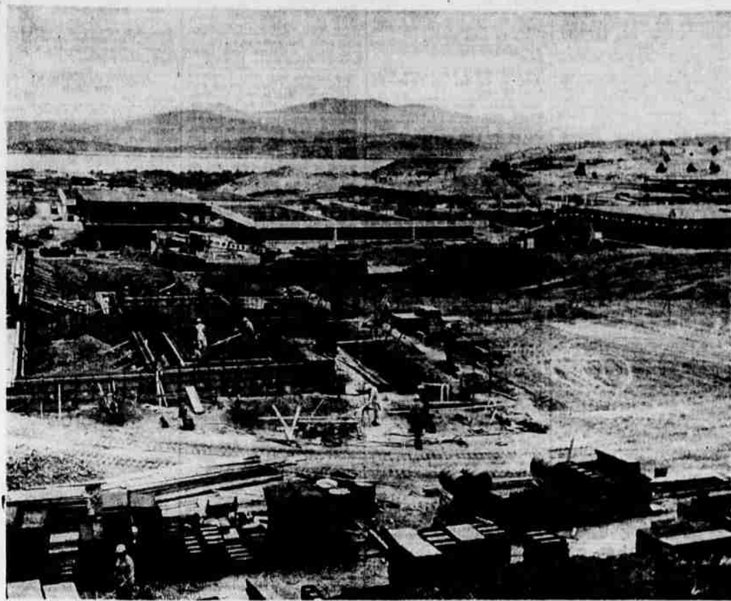
NEW OTI CAMPUS — Overall photo shows activity at the site of the new Oregon Technical Institute campus northeast of Klamath Falls. In foreground, workmen are beginning the new dormitory. OTI is expected to move into the new campus next year. Two classroom buildings

Eat 'Em Here or Orders To Go. LUCCA CAFE Ph. TU 4-3276 2354 S. 6th