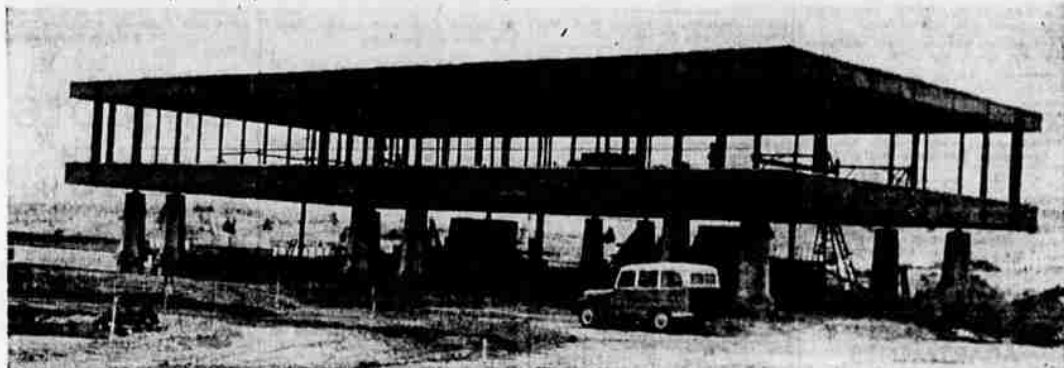
OTI ADMINISTRATION — This building being raised on concrete pedestals will be the administration center of

have already been completed. Near the campus site is the site of the new Intercommunity Presbyterian Hospital. The public will tour the OTI campus site next weekend during Homecoming.