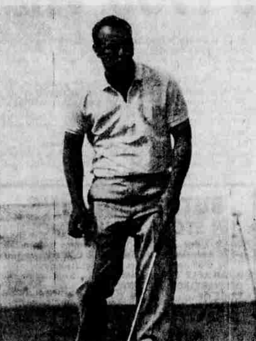
MOST UNHAPPY — Top money winner among the golf pros, Arnold Palmer, has a few words with himself after ridding a putt Thursday during the opening day of medal play in the $77,777.77 Sahara Invitational Golf Tournament at Las Vegas. Palmer told reporters before teeing off that an aching right shoulder may force him out of the tournament. He then played 18 holes of golf in 71 strokes — par.

HOLDS RECORD WASHINGTON (UPI)—Waller Johnson of the Washington Senators holds the all-time major league record of 113 shutouts during his career.