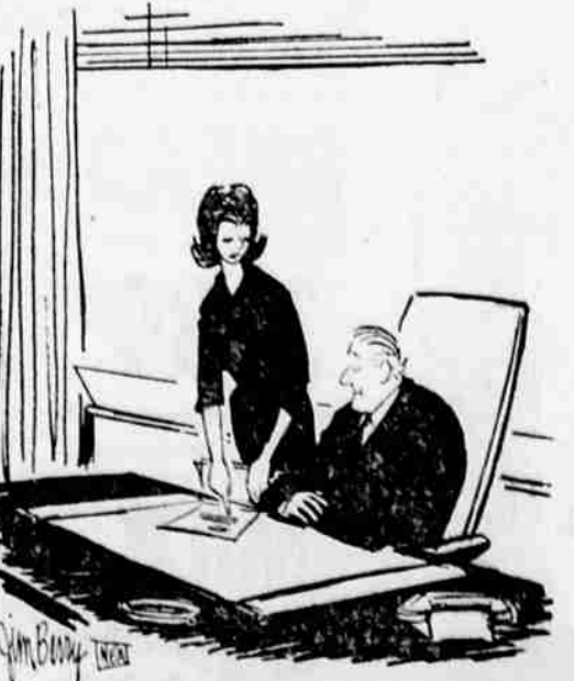
"Here's that letter about the slowness of Congress, Senator. Senator! . . . Scrup!"