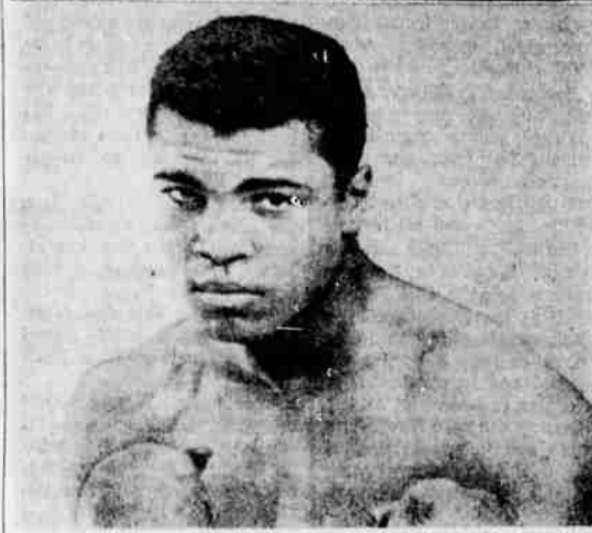
TITLE BOUT — The press representative of heavyweight champion Sonny Liston (top) said today Liston would fight Cassius Clay (bottom) for the title "sometime in February." In Louisville, Ky., Clay said the proposed fight would be more than welcome.