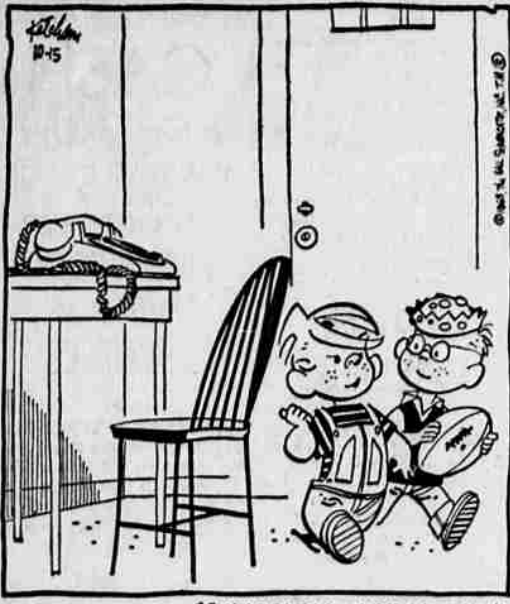
"I CAN DIRECT-DIAL EVERYBODY I KNOW!"