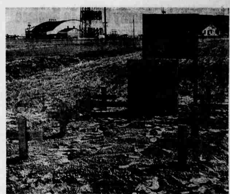
GRIM REMINDER — This grim display at the entrance to Kingsley Field was set up by the Kingsley Field Fire Department as a warning during Fire Prevention Week. Kingsley firemen, along with others throughout the county, made a special educational effort for fire prevention during the week.