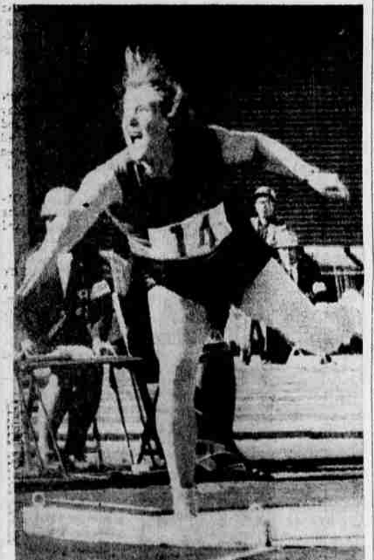
GOLD MEDAL WINNER — Russia's strong woman, Tamara Press, grimaces as she hurls the shot 17.27 meters to win the first Gold Medal at the Tokyo International Sports Meet Saturday. A crowd of 20,000 saw the 25-year-old Russian woman make a winning mark on the sixth and last try.