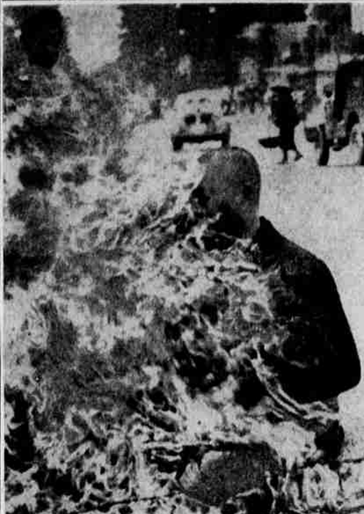
BUDDHIST BURNS — Young Buddhist monk keeps his erect seated posture as flames engulf him in ritual suicide at Saigon Market Square. It was the sixth anti-government protest suicide by flames in the past four months. U.S. has protested the beating by plainclothes police of three American newsmen who witnessed the suicide.

EUGENE (UPI) — Enrollments at Oregon's nine higher education campuses today totaled 32,390, up 1,713 over the 31,217 enrolled at this time last year. Officials said an additional 400 or 500 students are expected by the end of this week. All but Oregon College of Education and Eastern Oregon College reported enrollment increases. OCE had 1,319 compared to last year's 1,393, and EOC had 1,111 compared to 1,125. Oregon State University topped the list with 10,291, compared to 9,826. University of Oregon had 9,560 compared to 9,348. Portland State had 6,564 compared to 5,744. Southern Oregon College 2,044 compared to 1,792. Medical School 651 compared to 601. Dental School 384 compared to 336, and Oregon Technical Institute 906, up four from last year's 902. Officials said registrations were up 5.5 per cent over last year. They said a 6.2 per cent increase had been anticipated.