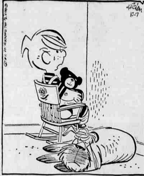
*SHE OUGHTA DO SOMETHIN' 'BOUT HER NERVES!*