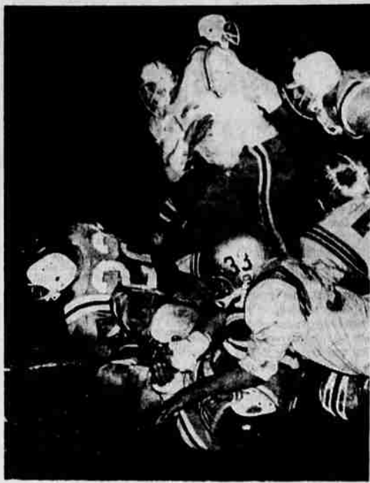
of 111 yards gained. At right, Sonny Luke crashes over from one yard out for the third Owl score of the night. This one, plus the third straight extra point kick by Bob Bonner gave the Owls a half-time edge of 21-0.