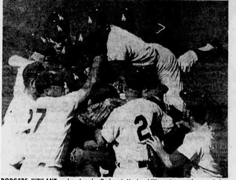
DODGERS JUBILANT — Los Angeles Dodgers' Yankee-killing star southpaw pitcher Sandy Koufax is all but buried under his teammates at the end of the game Sunday as the Dodgers piled on him to congratulate him on winning the final game 2-1. Koufax hurled two of the Dodgers four straight wins over the Yanks.

The Yankees were rated superior in both those departments before the series opened with the Dodgers given the edge in speed and pitching. It turned out that the Dodgers had the edge in everything and thus brought about their baseball miracle.